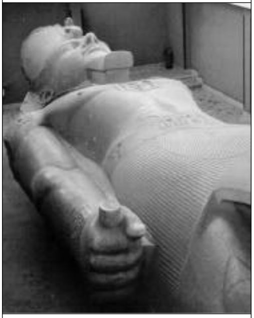
Within a concrete pavilion lies the limestone colossus of Rameses II. Originally 13.5 metres in length, the broken statue is now 10.5 metres. Note the Wand in the right hand.

activity of the energy flow proceeding from the crystal.